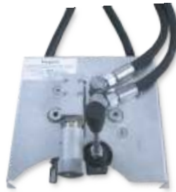
Hydraulic hoses with speed adjustment, 5 m