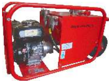
Hydraulic Power Pack with petrol engine type BHA 200/10

The cable pusher is driven by an electric motor. By means of appropriate power distributors, several cable pushers may be operated in parallel. Upon request, the cable pusher will be supplied with hydraulic motor to be connected to a hydraulic power pack or the hydraulic system of a mini-excavator.