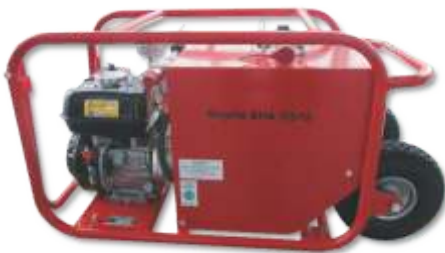
Hydraulic Power Pack with petrol engine type BHA 125/15

The connecting hoses between the BKS 400 and the power pack are equipped with a flow divider, which guarantees the infinitely variable adjusting of speed.