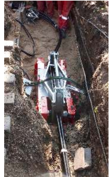
Laying of 3 x single core 30 kV