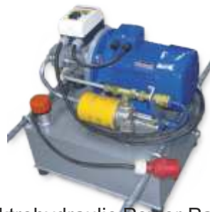
Elektrohydraulic Power Pack BHA 120/12