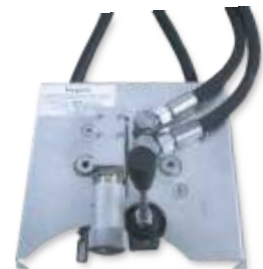
Hydraulic hoses with speed adjustment, 5 m